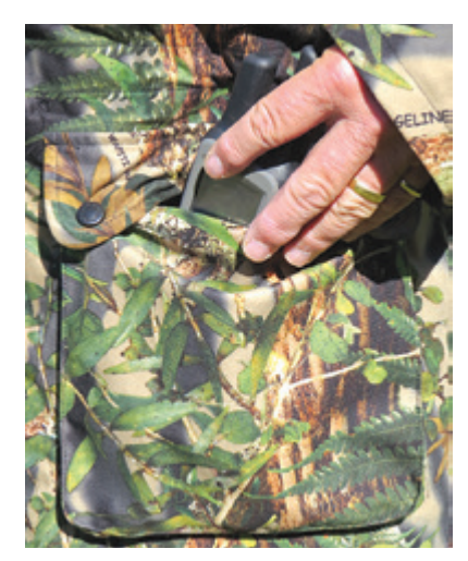
Ample cargo pockets for all hunting accessories.

First up is the ample length and extra bum tag, which is generally missing on foreign designs, but essential for our conditions. Secondly, the volume is there without any compromise to comfort, or style if you are mirror conscious, which is so important with the modern trend in clothing for lightweight layering systems. This is particularly noticeable (actually it's not because it's so comfortable you forget you are wearing it) around the shoulders and arms, so you have good freedom of movement, and the extra volume actually creates a pocket effect that adds to the warmth.